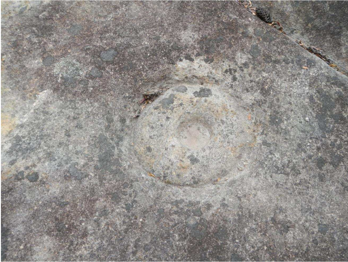
FIGURE 7: Star Marker- circle within a circle