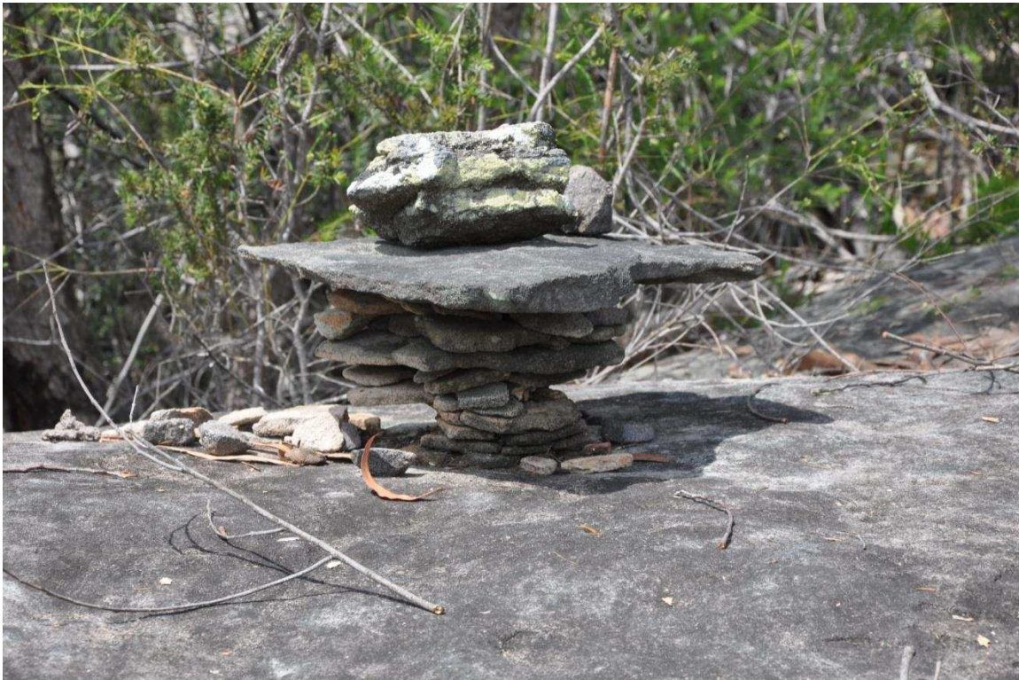
FIGURE 10: Possible astronomical construction (one of three found on this platform)

That detail and cleverness in placement of rocks is most evident, the fact it can balance such a large rock on the top is testimony to a monument that was constructed with care and attention to detail.