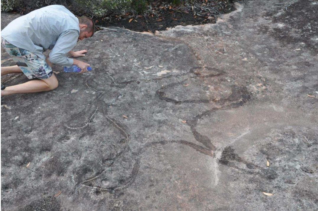
FIGURE 9: Sky Hero possibly marking out magnetic reversal of the poles

The third Sky-hero (figure 9) is a work in progress. None of the Elders were able to add anything, the image was unknown to them. What I did notice was this Spirit had a club foot and the other leg was longer, this is an obligatory representation whenever Duramullan is depicted, and in what only added to the intrigue his left arm was 100% longer and his left leg 50 % longer. It was as if some massive force was pulling his body towards one direction, could this possibly depict a pole shift, when the Earth's magnetism was suddenly reversed?