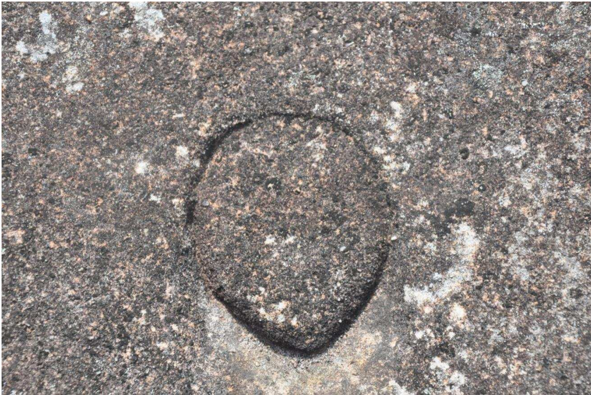
FIGURE 4: Star Marker- cut is not as deep but much sharper angles