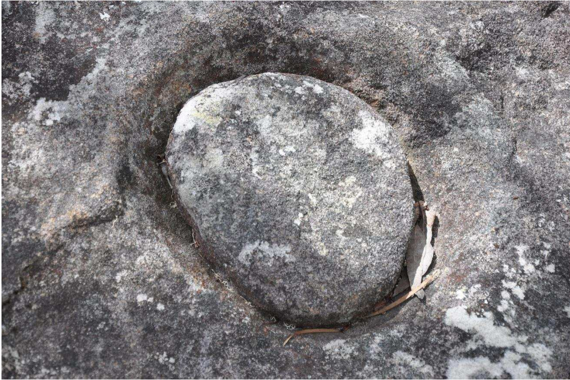
FIGURE 3: Star Marker- part of spherical/oval classification