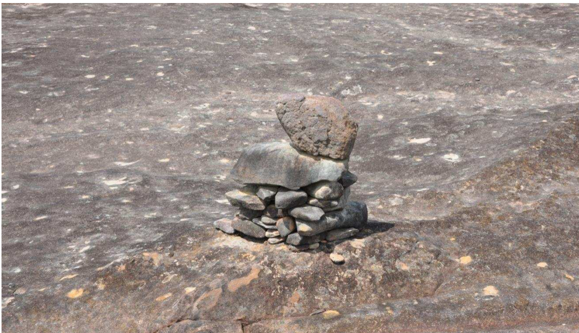
FIGURE 11: Possible astronomical construction (one of the three found on this platform)