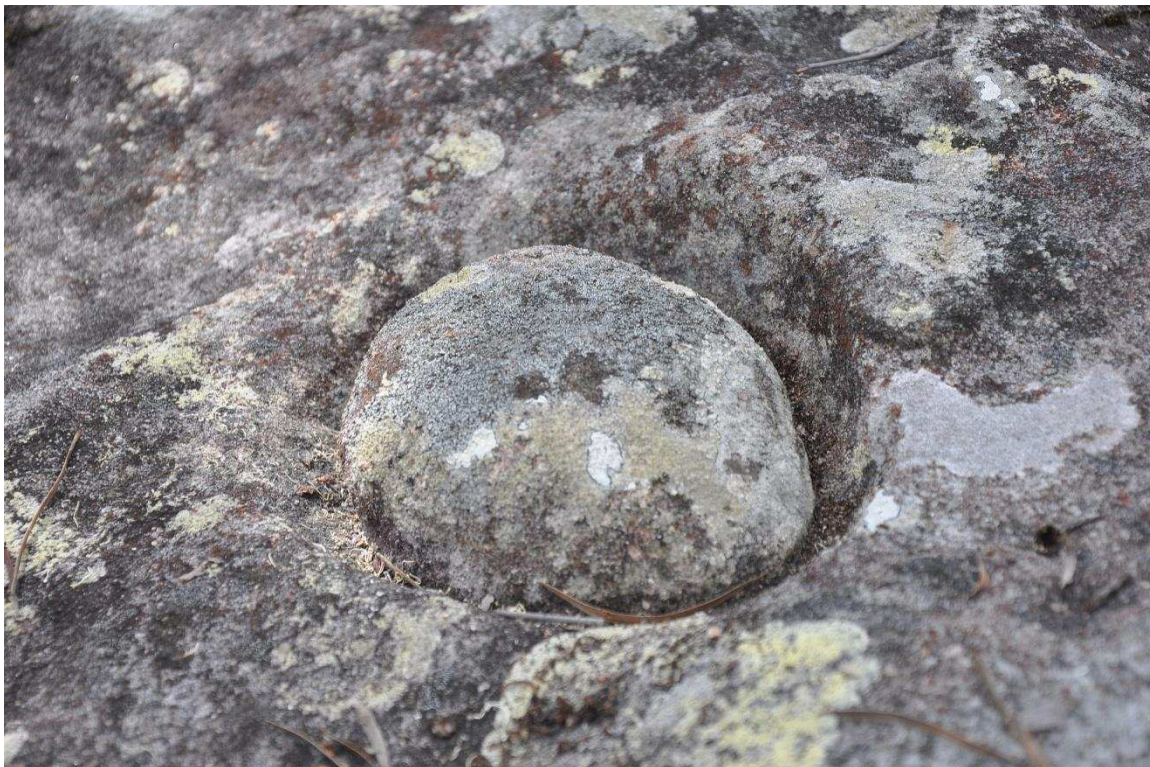
FIGURE 2: Star Marker part of the circular classification

There are many factors that led us to the opinion there are at least 8 different types of astronomical markers (see figures 2, 3, 4 and 5) found within the area we are studying which perform a variety of duties, some of which will become more apparent as the paper develops. From an Original perspective, first and foremost is the result of our extensive consultation with relevant Elders and Custodians, and the enormous amount of Dreaming stories focused upon “on top,” 9 in particular the Seven Sisters (the Pleiades). It is well known that “the Aborigines were curious about the natural world. They were not only keen observers of the night sky but also took much delight in classifying the physical characteristics of the stars above them.” 10 So ingrained into the collective psyche of Original society is “knowledge of the stars to the Aborigines in their night journeys and of their positions denoting particular seasons of the year, that astronomy is considered one of the principle branches of education.” 11