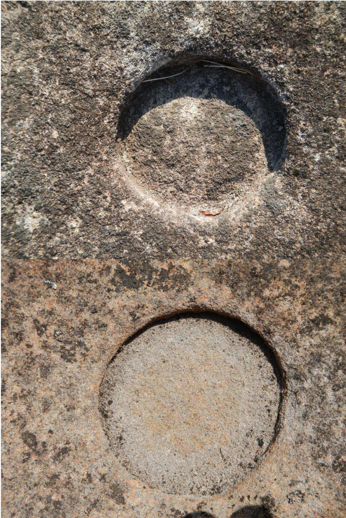
FIGURES 5 & 6: Star Markers- note precision of cut and exactness of curve