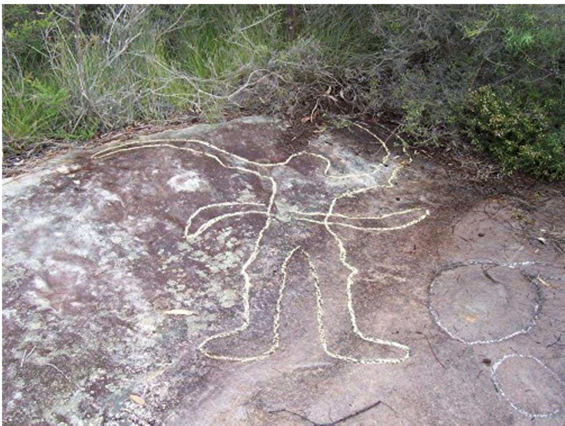
FIGURE 8: Duramullan possibly marking out a plasma event/Milky Way/Belt of Orion

Within two kilometers of the central rock platform are three engravings/peckings of original Sky-heroes that embrace that title in its most literal sense. All three serve astronomical goals, in two cases this information was shared by Elders and custodians of local Lore. One engraving is quite well known (and poorly misunderstood) and if included would provide clues as to where the other sites are, so we have decided not to provide a photograph or specifics beyond stating that its primary function is to mark out the alignment of a constellation. The other two are, we believe, different representations of Biamie's (the First Creation Spirit) son, Duramullan. The first engraving (figure 8- this photo and the one to follow are of a very sacred nature and should not be viewed by Original women steeped in ancient Lore and ceremony) is claimed to mark out an ancient plasma event, a time when a massive pulse of energy released by the sun surged through the magnetic channels of the Earth creating auroras that lit up the sky at Gosford.